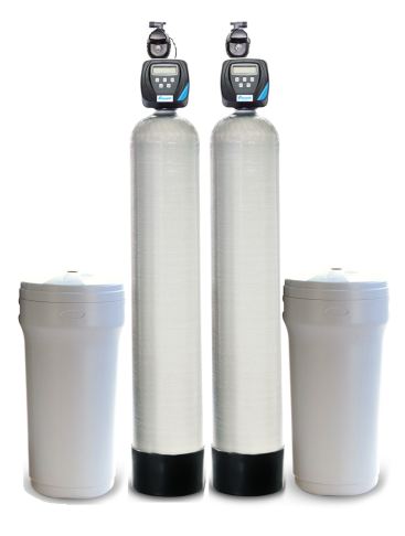
2 - 6 SYSTEMS